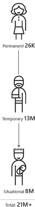
Figure 2. The Benefits of the Persona Spectrum, Solving for one-person with upper extremity loss and extending for many. Image Created by Microsoft 2016 Licensed under Creative Commons Attribution-Non Commercial-No Derivatives (CC BY-NC-ND)

The persona spectrum is a design tool where, "When we design for one person who experiences mismatches in using a solution, we can then extend the benefits of that design to more people by asking who else might want to participate but is excluded on a temporary or situational basis" (Holmes 2018, 108). In Figure 2, there are only 26,000 people in the US who suffer from upper extremity loss: too small a number for a company to consider, resulting in an orphan or